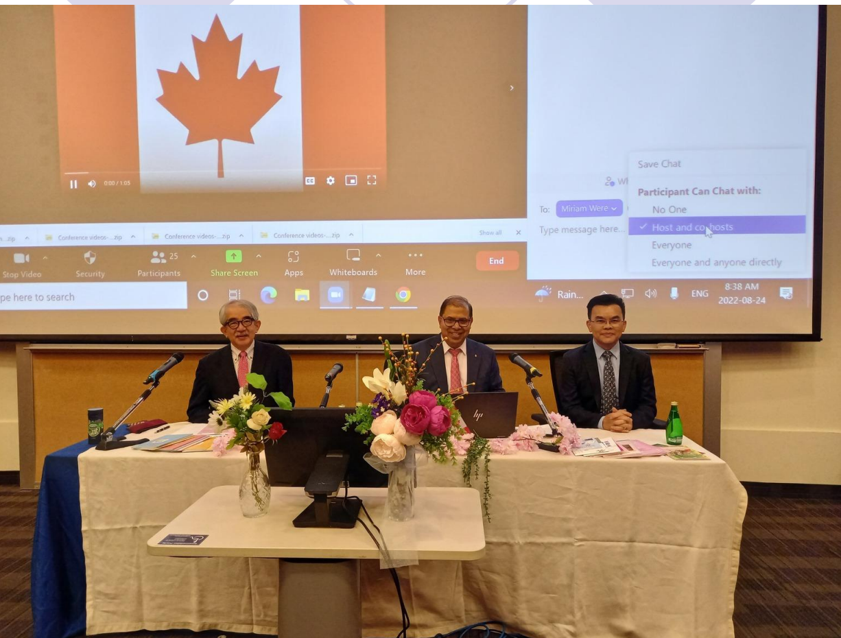
Conference on MCH Handbook Toronto University, Aug. 2022

International Committee on MCH handbook, Toronto University Collaboration: WHO, UNICEF, UNFPA, JICA