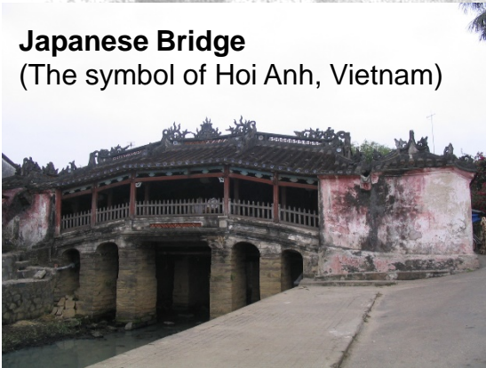
Japanese Bridge (The symbol of Hoi Anh, Vietnam)