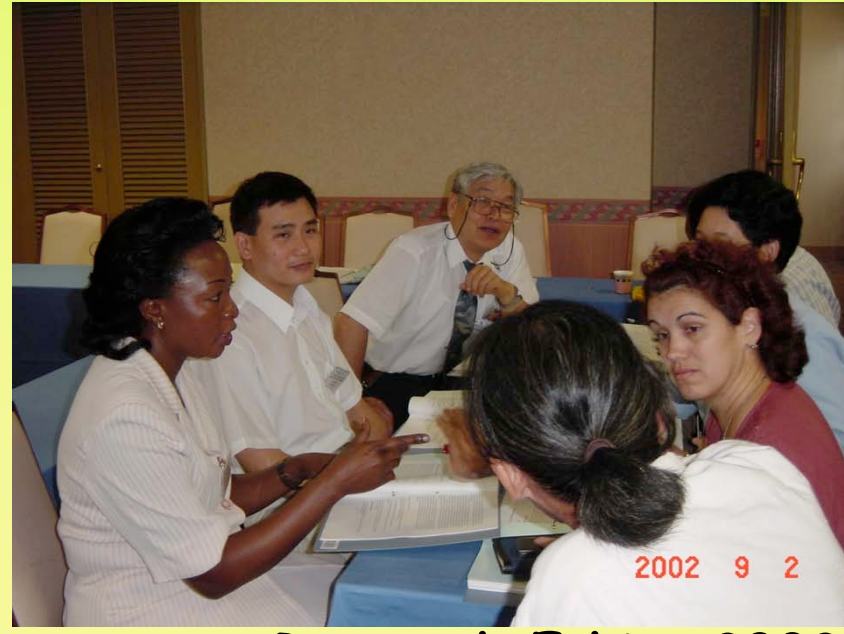
Research Ethics 2002