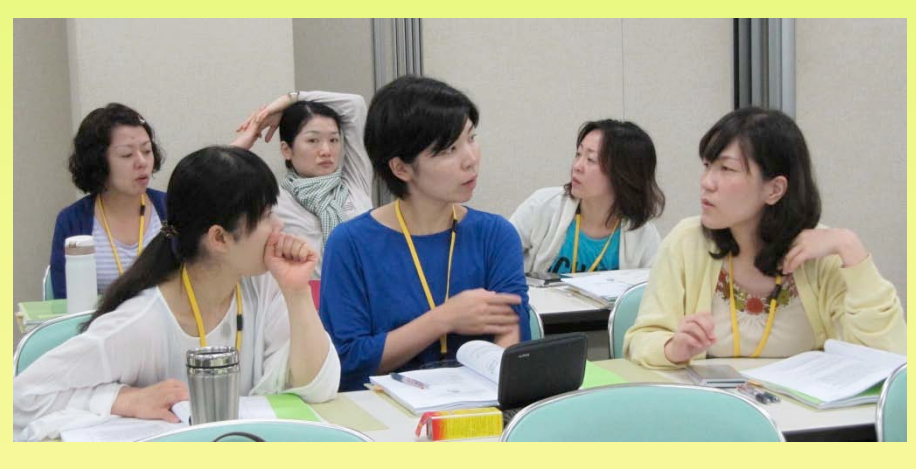
Research Ethics 2010