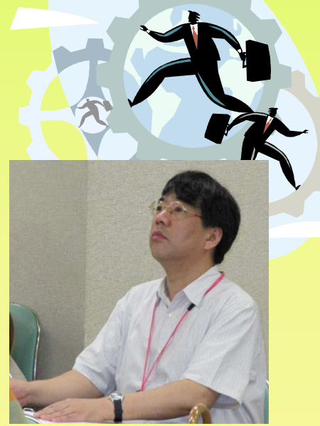
Research Ethics 2009