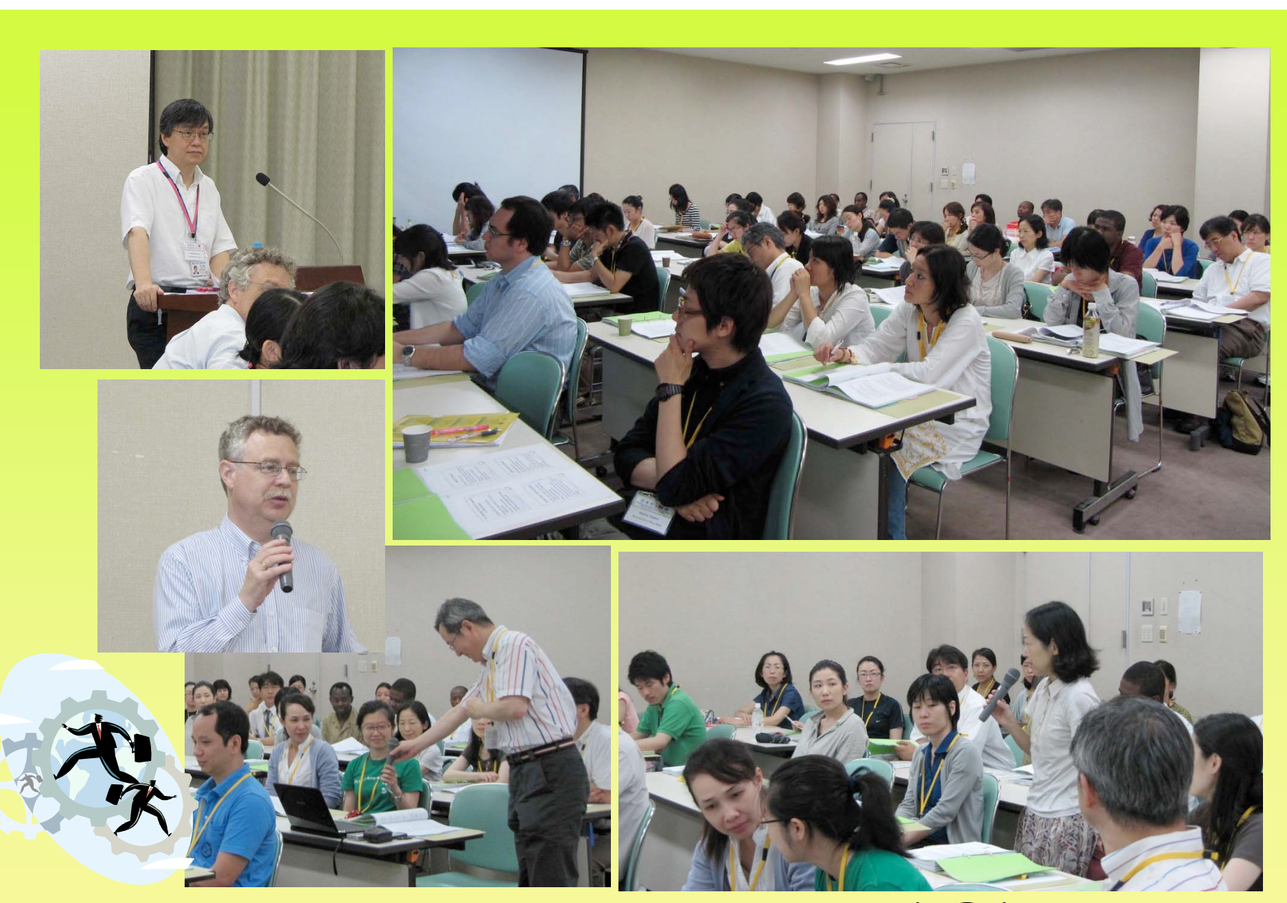
Research Ethics 2010