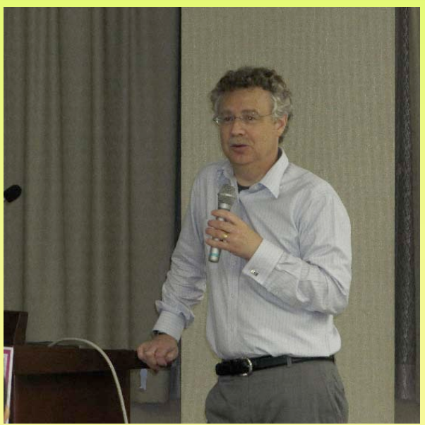
Research Ethics 2009