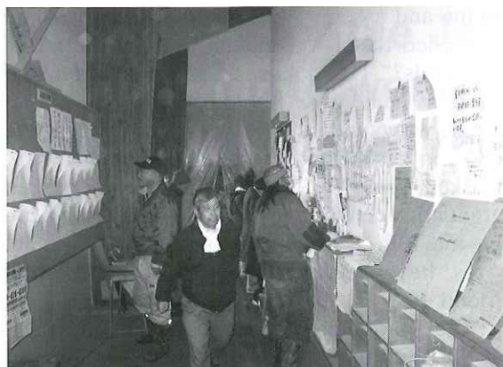
An evacuation shelter

and Futaba Elementary School, we went further north from Kamaishi to Otsuchi and Kirikiri. On the way, we heard that there was an isolated nursing home that had not received any supplies. The building was an old Japanese-style restaurant called Koufuku-rou, ("Happy Inn") that had been converted into a nursing home. The road was blocked and it was going to be a 20-minute walk up a mountain, yet it was the female doctor who was with me who said, "Let's go!"