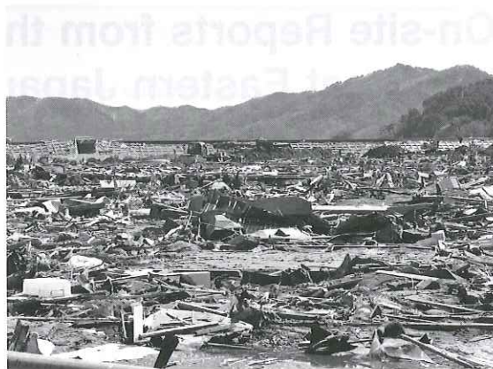
The town of Otsuchi

around Kamaishi and Otsuchi. Our 4-member group includes two nurses from Kamaishi and Otsuchi. We are worried about the accidents at the nuclear power plant in Fukushima Prefecture, so I decided that the volunteer students who accompanied me from Tokyo should return. If you have any information, please forward it to us.